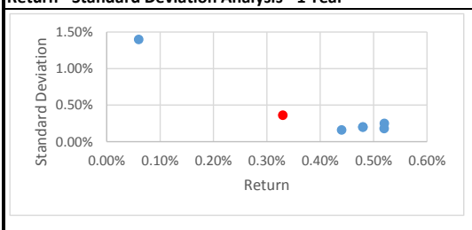
Return - Standard Deviation Analysis - 1 Year